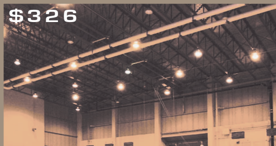
400 watt Metal Halide: Annual Energy Cost*