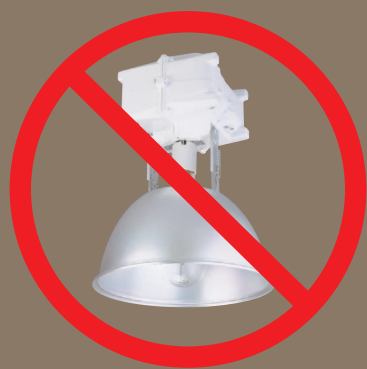
400 watt Metal Halide

Annual savings of $16,200 for every 100 fixtures replaced one-for-one*