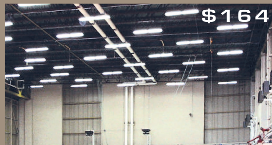
MX: Annual Energy Cost*